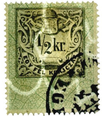
Issue with wmk. 1876 (RR) lighted through & magnified with 150%